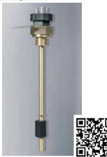
Level Switch/Temperature Option UNS1000-BN18