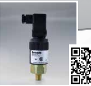
Compact Pressure Switch Series 96201, 96211, 96221