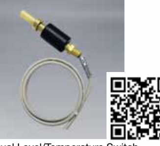
Dual Level/Temperature Switch UNS-MS

General Industrial J-Box Transducer Series 423N1, 425N1, 426N1